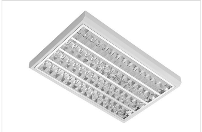
OTA.LED met 4 reflectoren

LED opbouwarmatuur voor kantooromgeving. 1, 2 of 4 dubbel parabolische reflectoren uit hoogglans aluminium met LED-cover. Versie met mat aluminium reflectoren op aanvraag. Basis uit witgelakte staalplaat.